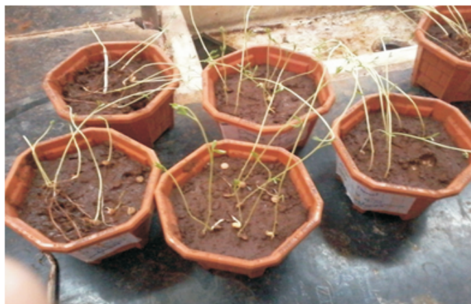
Fig.4 Final stage

The germination rate, change in root length and shoot length of plants are shown in graphs. The analysis of the results show that the growth of plants is dependent on exposure duration. High exposure duration may be harmful to the growth of plants. These values were taken as mean values of the length of ten plants grown in each pot. Around 120s exposure duration at 100w power was observed as the best value for the growth of seeds.