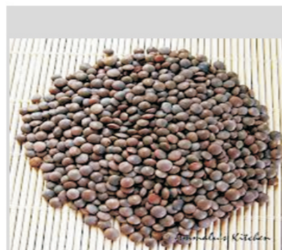
Fig.2 masoor seeds