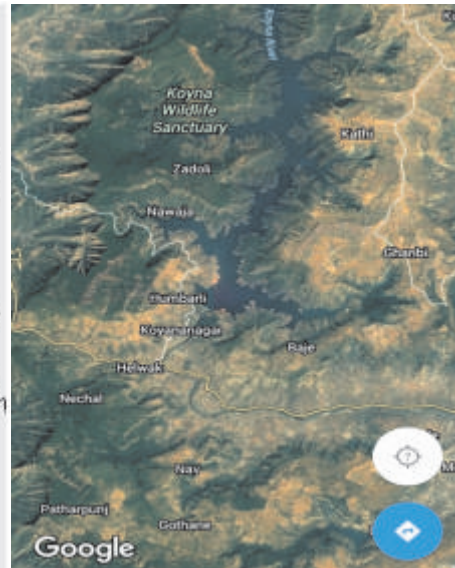
Fig.2. Satellite view of Koynanagar

Ganoderma is a genus belonging to order Polyporales and family Ganodermataceae. They grow on wood and are commonly known as the bracket fungi. They are characterized by large, perennial basidiocarps called as conk. They are typically leathery with or without stalk. The pilear surface is dark to reddish brown. They show typical trimictic hyphal system. The basidiospores are double walled. They are saprophytic on dead wood as well as parasitic on the live wood of trees causing white rot. G. lucidum is medicinally important and is used in treatment of cancer and other diseases. It was observed that Koyna region show presence of plenty of fungal species from genus Ganoderma . Two such frequently occurring species of Ganoderma viz. G. lucidum and G. applanatum were studied in detail for their morphological and microscopic characters and presented in this paper.