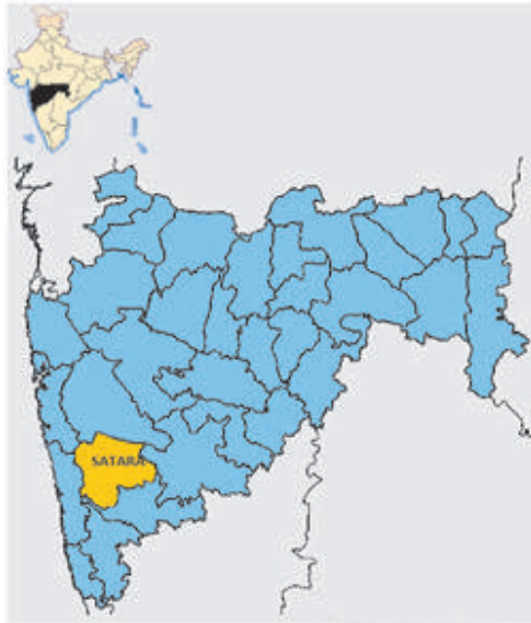
Fig.1. Map of Maharashtra

Satara district is located in the western part of Maharashtra in Sahyadri ranges. It occupies an area of 10,484 Km 2 . It is situated at 17.5° to 18.11° North Latitude and 73.33° to 74.54° East Longitude. The average rainfall here is 2643 mm. Koyna is a small town in Patan taluka of Satara district. It is also called Koynanagar. It is on Chiplun-Sangli state highway on the banks of Koyna River. It is situated at 17.3919° N, 73.7404°E. This region is famous for Koyna Dam and Koyna Hydroelectric Project. It is well nestled in the Western Ghats about 2,448 above sea level. The forest type here is of Southern tropical evergreen forests and mixed deciduous forests. The flora is dominated by Anjan, Jambhul, Awala, Hirda, Amba, Umber, Bibba, Palas, Mango, Babhul, Cassia etc.